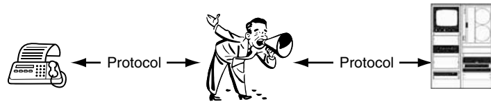
Figure 7.2. Telecom interface with translator.

possible to publish only one side of the specification and design components on that side.